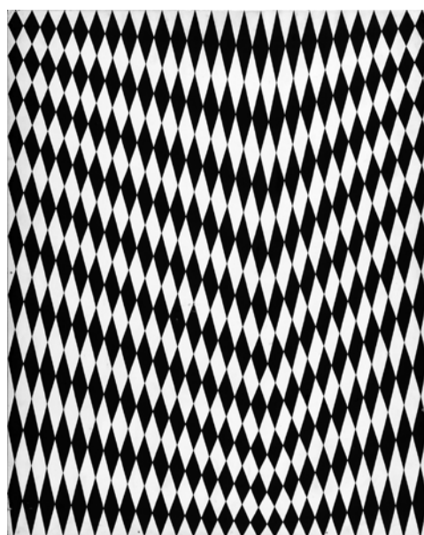
Untitled by Bridget Riley

The Neuberger Museum of Art's current exhibition, on view through March 13, 2016, begins with a year of turbulent politics, economic inequality and racial injustice. After 1965: Art in a Time of Social Unrest looks at this time period, and how artists reacted to the world around them. The Neuberger examines those artworks, which often resulted from an artist's struggle to communicate his or her feelings about these occurring events. This show, which displays only monochromatic works in black and white, also asserts that these unsettled social issues continue to this day. In the years between then and now, the art world has produced an array of work that influences the cultural landscape today. Special programming for After 1965 includes a lecture on Power, Visibility and Violence on February 11 and a series of screenings on March 9 that explore how films and video represented the time period examined in the show. For more info, visit: neuberger.org .