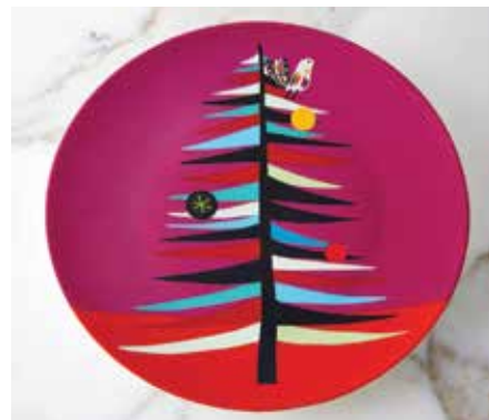
Holiday plate at Neiman Marcus

Neiman Marcus, Westchester and ArtsWestchester invite shoppers to attend a holiday reception on December 1 as part of ArtsWestchester's #GivingTuesday