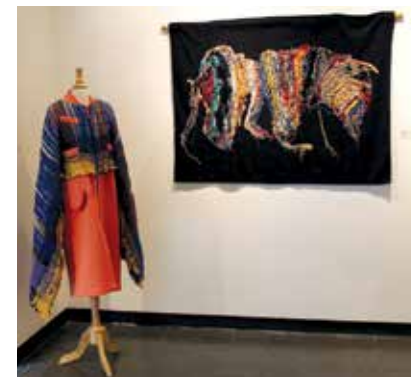
Loop of the Loom

This display of handcrafted artwork from local and national artists showcases contemporary craft items born from both new and traditional techniques. These unique crafts act as a creative alternative to mass-produced gifts sold in popular stores. With a focus on generating social awareness through art, the exhibition and sale, which take place through January 2, also provide an opportunity of reflection for guests and shoppers. For more info, visit: pelhamartcenter.org .