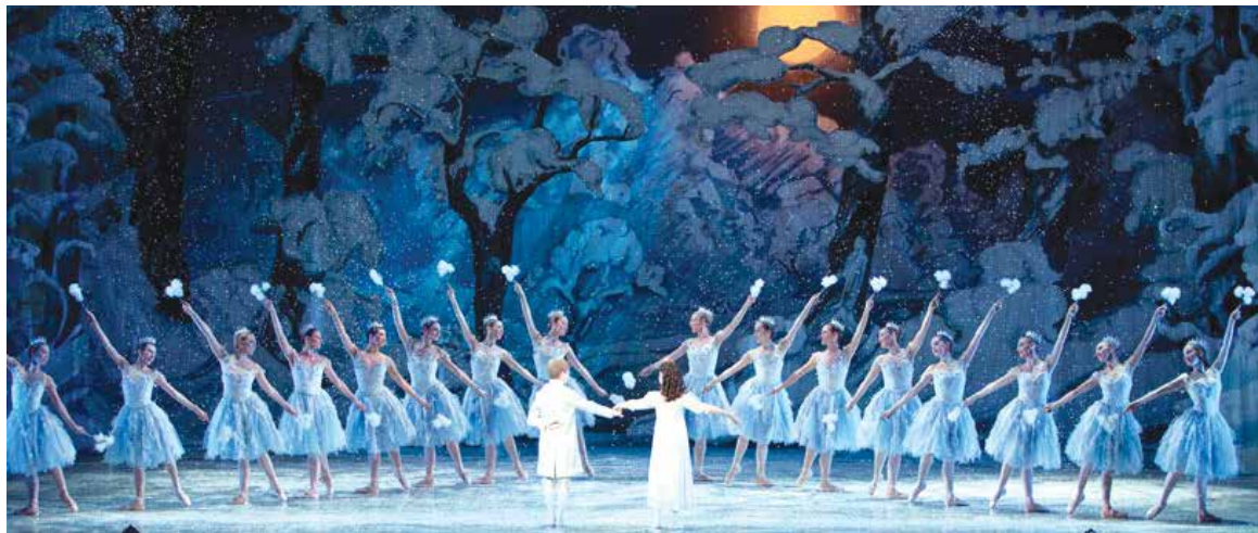
New York City Ballet's production of The Nutcracker, The Picture House, 12/13