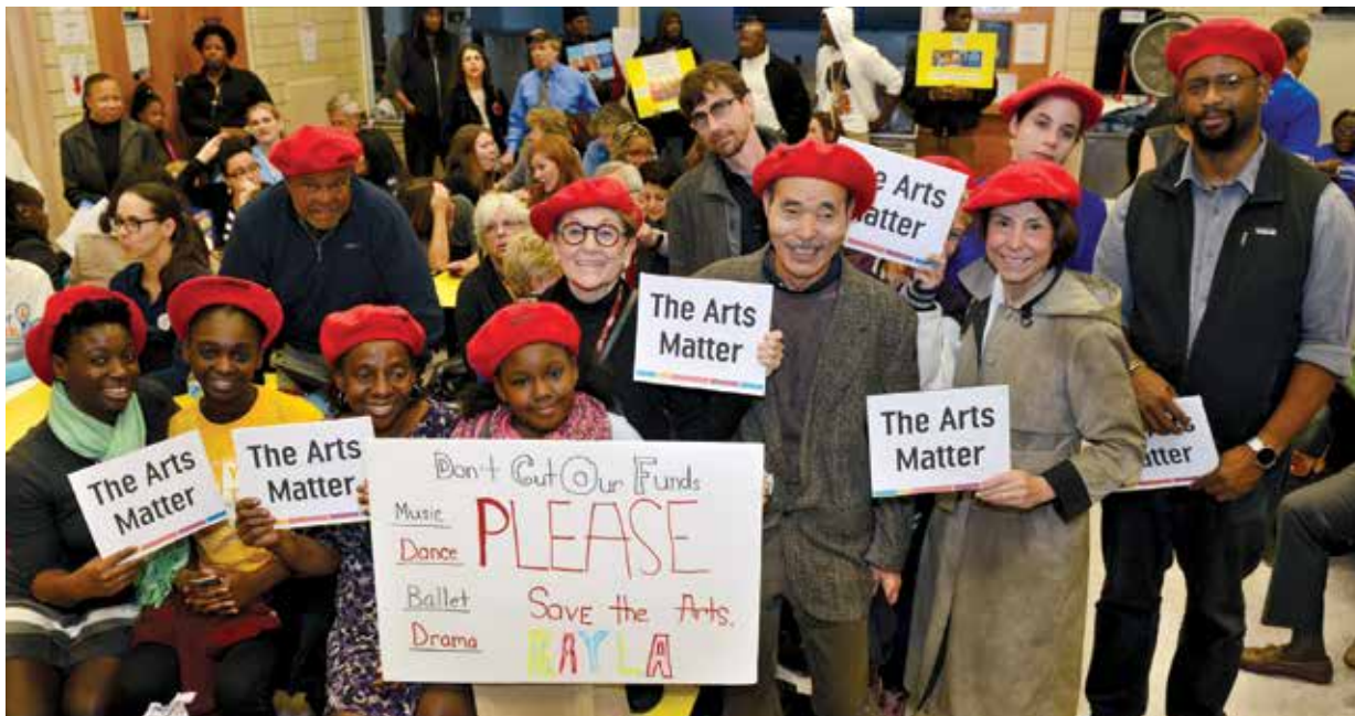
Arts supporters at the Yonkers public hearing for the Westchester County budget on 11/19

Westchester residents consider the arts, especially free summer community concerts, to be a quality of life issue that is really non-negotiable. The arts must continue to thrive in our county.