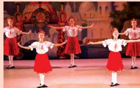
White Plains Performing Arts Center presents The Nutcracker , performed by Greenwich Ballet Academy