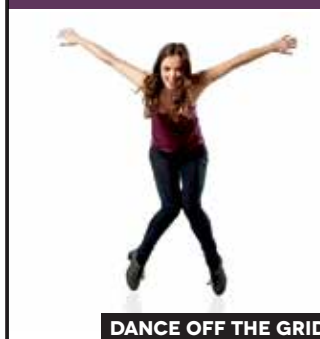
DANCE OFF THE GRID

The very best in live performing arts right here in Westchester! THEATRE/DANCE/MUSIC/COMEDY/FAMILY/FILM