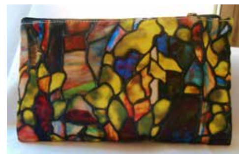
Cosmetic bag by Marisa Boan

With a wide range of gifts to choose from, Blue Door Gallery's Holiday Art Show and Boutique gives shoppers an option for everyone on their shopping lists. Through December 22, guests can sip eggnog while they peruse the gallery and shop for one-of-a-kind handcrafted items by local artists, from jewelry and scarves to notecards and accessories. For more info, visit: bluedoorartcenter.org .