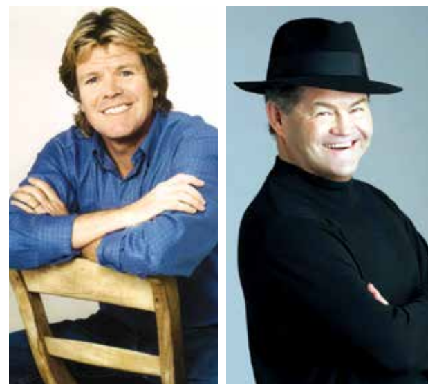
Peter Noone and Micky Dolenz

On January 8, Tarrytown Music Hall presents a conversation between two musical icons. Peter Noone is leader of the 60s pop band Herman's Hermits who currently hosts Something Good on SiriusXM Radio. Micky Dolenz, drummer and lead singer of The Monkees, has penned some of the most recognizable and beloved songs of the 60s. They have both sold millions of records and continue to entertain, but for a limited 3-night tour, the two will join together on stage for an intimate evening of conversation. Fans will now get the rare opportunity to hear two dynamic musicians from internationally successful bands share candid, never-heard-before stories about their lives both on and off stage. For more info, visit: tarrytownmusichall.org .