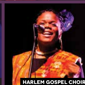
HARLEM GOSPEL CHOIR

EMELIN.ORG | 914.698.0098 | MAMARONECK, NY WORLD CLASS. RIGHT HERE.