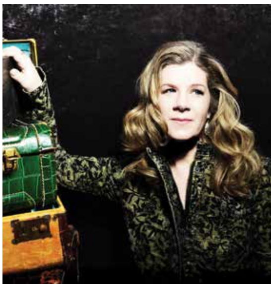
Dar Williams

Irvington Town Hall Theater presents nationally recognized singer-songwriter Dar Williams on December 5. Off the heels of her latest album, Emerald , Williams, who grew up in Chappaqua and resides in Cold Spring, will return to the Westchester stage to perform her folk-infused lyrics about her personal experiences and the broader culture of community. Opening the evening will be The Nields, a band whose honest lyrics and folk-infused melodies meditate