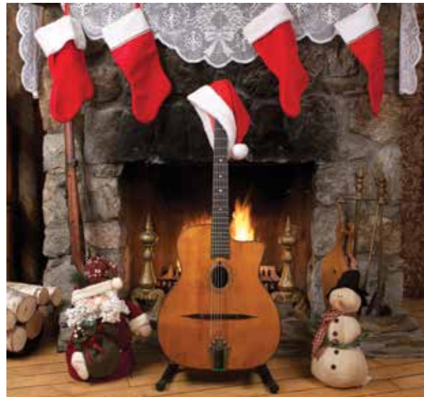
Doug Munro and La Pompe Attack's A Very Gypsy Christmas album cover, ArtsWestchester , 12/5