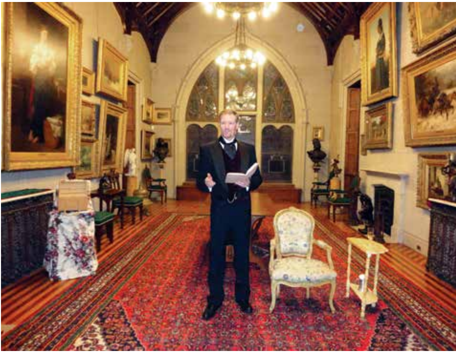
Mr. Dickens Tells 'A Christmas Carol' at Lyndhurst, 12/4-27

➔ visit www.artswestchester.org for more event information