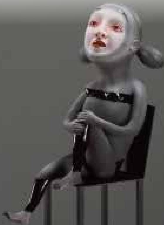
Lunar Lunacy (detail) Work by Artists in Residence, Clay Art Center, 7/11–8/22

This provocative contemporary art exhibition explores universal concerns of memory, identity and cross-culturalism within New York’s immigrant community. | artsw.org/crossingborders