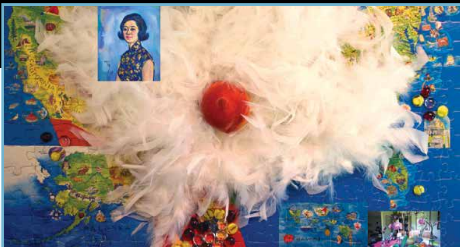
Conversation with Orchid (detail) by Bibiana Huang Matheis, Crossing Borders, ArtsWestchester, 3/17–5/2