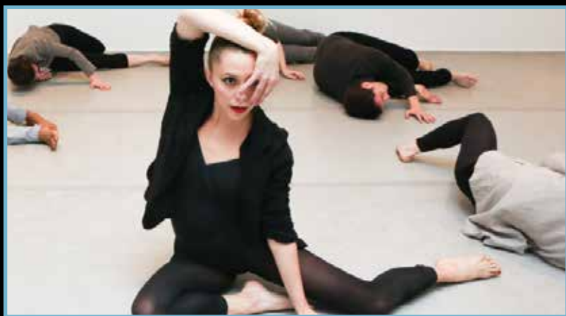
Reject Dance Theatre, 4/17