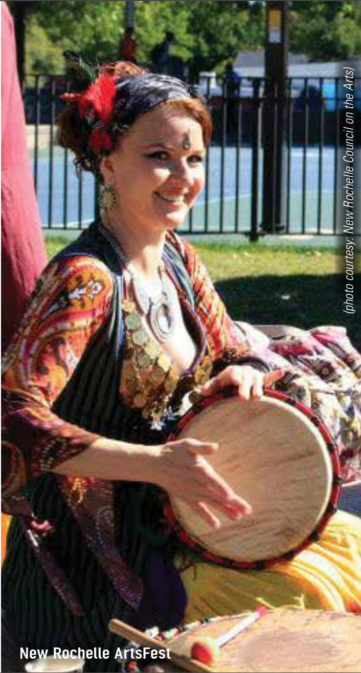
New Rochelle ArtsFest