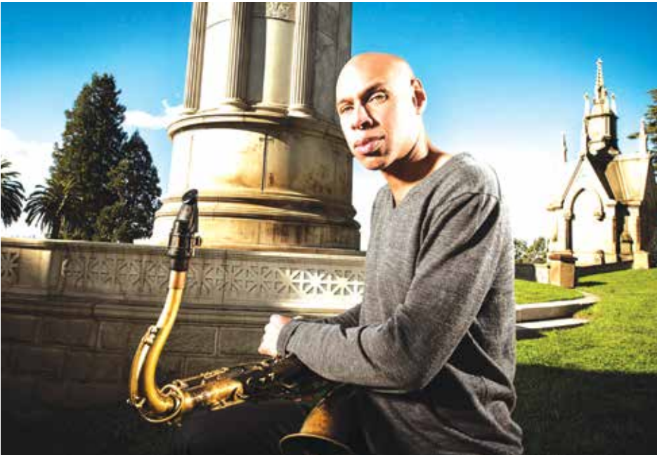
Joshua Redman

For its Fall Festival, Caramoor experiments with brave collaborations on its stages. Banjo virtuoso Béla Fleck lends an element of bluegrass to the inventive string quartet Brooklyn Rider. The symphonic group The Knights will play two shows – one with jazz saxophonist Joshua Redman and his quartet, the second with classical violinist Gil Shaham. The latter pairing will also play a children-focused mid-day concert to help introduce youth to the world of music. Guests can spend the day on Caramoor’s grounds and discover its sound-art exhibition, In the Garden of Sonic Delights , or take a tour of the historic Rosen House. A festival weekend pass offers a discounted rate for those who want to attend multiple shows. For those who can’t witness these performances first-hand, a partnership with WQXR will broadcast the concerts live on WQXR (105.9FM) and WQXW (90.3), and online at www.wqxr.org .