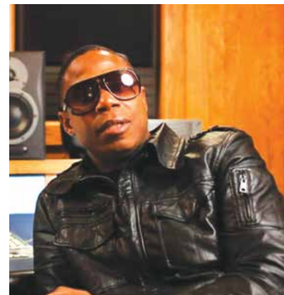
Doug E. Fresh

The City of Mount Vernon kicks off its 13th annual Arts on Third festival on September 14. Visitors can enjoy food from two international food courts while basking in the entertainment on any of three stages. Headlining the festival's entertainment will be hip-hop legend Doug E. Fresh. Also featured are jazz icon Tito Puente, Jr. and 70s soul