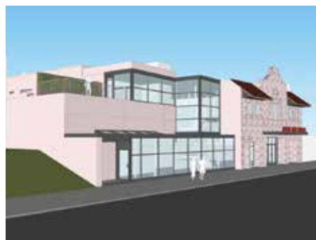
Jacob Burns Film Center Rendering