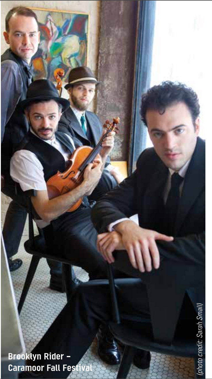
Brooklyn Rider - Caramoor Fall Festival