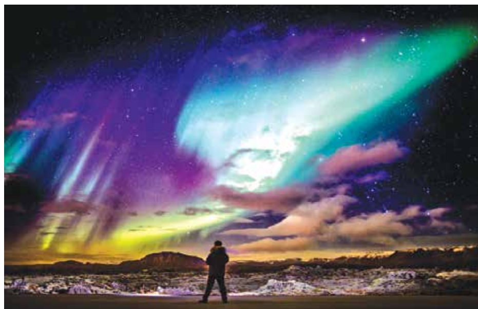
Still from The Fire Within, now showing at Katonah Museum of Art in conjunction with exhibition, ICELAND: Artists Respond to Place, through 9/28