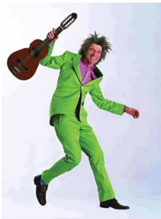
Dan Zanes

Arts festivals flourish this fall season as the air begins to cool, the leaves turn crimson and gold, and apple cider warms our souls. Westchester residents can enjoy one-of-a-kind works of art, family activities and craft demonstrations. The following fall arts festivals start the season off right.