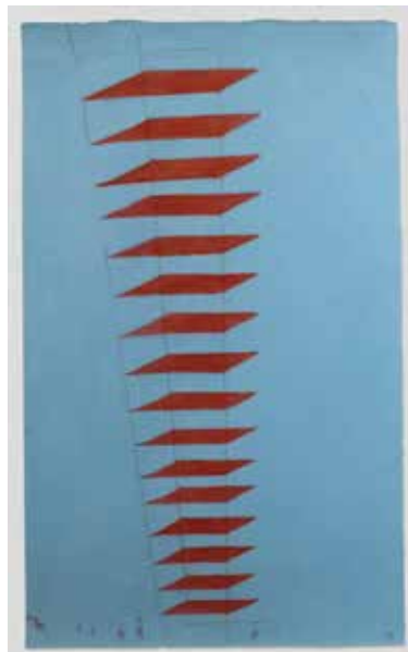
Louise Bourgeois, UNTITLED, 1988, Ink and pencil on blue paper, 15 1/2 x 9 1/2", 39.4 x 24.1 cm., Collection BNY Mellon.

Approaching a milestone 50th anniversary next year, ArtsWestchester invites area companies to join its anniversary celebration by starting an Arts & Business Partnership program. ArtsWestchester offers a diverse menu of partnership ideas for businesses to support the arts while promoting their companies. Custom programs for businesses to participate in the arts include: arts in the workplace programs, arts event and exhibition sponsorships, corporate underwriting of ArtsWestchester's monthly newspaper and website, and arts education program sponsorships as well as gallery rentals in ArtsWestchester's downtown White Plains building.