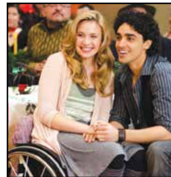
Still from Musical Chairs

On September 15, the Steffi Nossen School of Dance and Music Conservatory of Westchester will present the Westchester premiere of Musical Chairs , a film about the healing powers of dance. Directed by award-winning