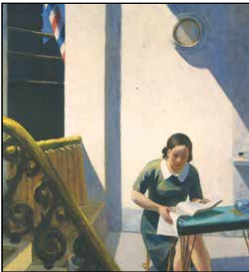
The Barber Shop by Edward Hopper

The Neuberger Museum of Art (NMA)'s current exhibition, When Modern Was Contemporary , provides a unique insight into the development of modern art in the United States. The show chronicles the private collection of the museum's namesake, Roy R. Neuberger. Amassed mainly between the end of World War I and the start of the Cold War, the works remain among the finest personal art collections in a public institution in the United States.