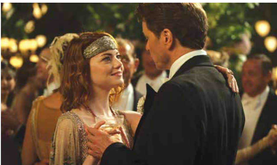
Still from Magic In The Moonlight , now showing at Jacob Burns Film Center. For film times, visit: www.burnsfilmcenter.org

Paris is a fusion of theater, live music, and dance. 3pm. www.artscenter.org