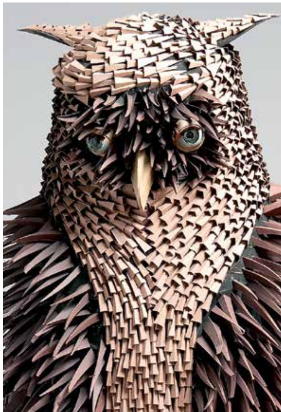
'Untitled' paper sculpture by Irving Harper